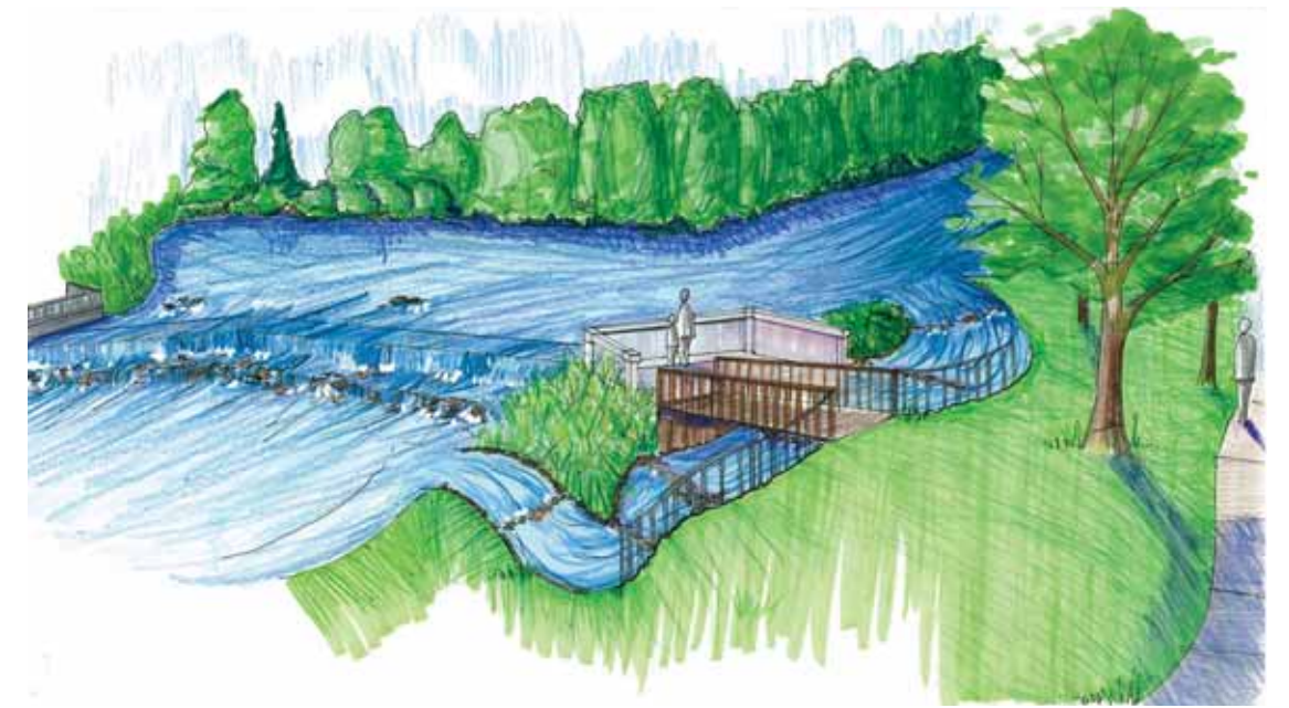
Bird's Eye view of Bypass and Existing Dam Not to Scale