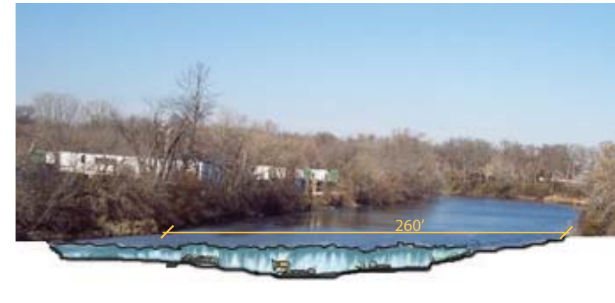
Dam Removal Alternative No Change from existing