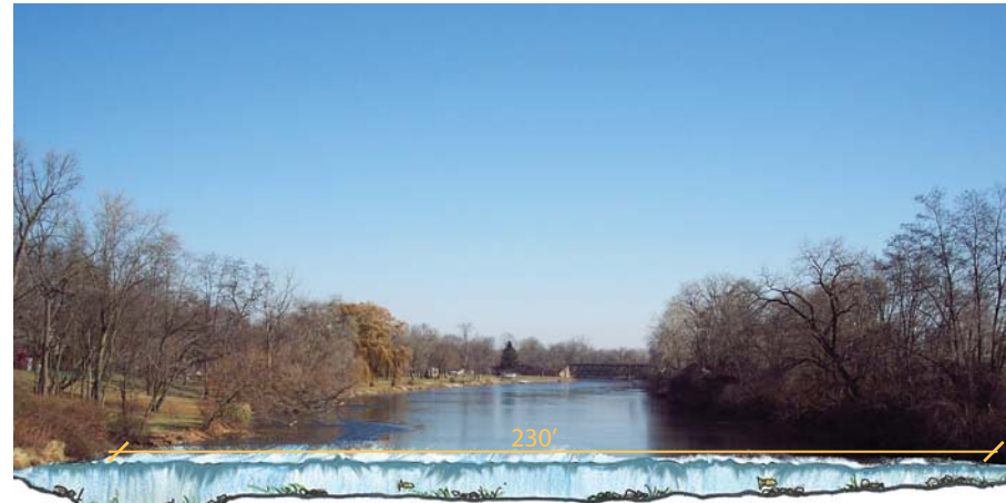
Rock Ramp Alternative & Bypass Alternative No Change from existing