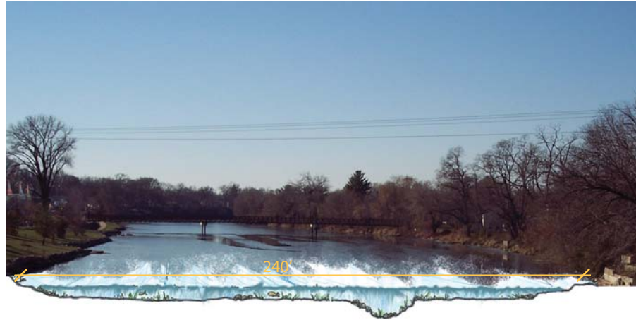
Rock Ramp Alternative & Bypass Alternative No Change from existing