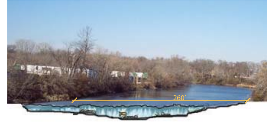
Rock Ramp Alternative & Bypass Alternative No Change from existing